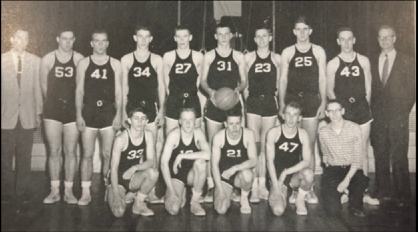
KHS 1960 Basketball Team