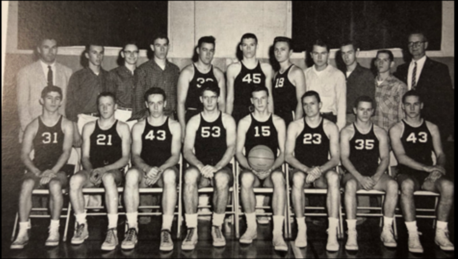
KHS 1961 Basketball Team

1961 - Most of the games between Kennett and St. John were always close, decided by one or two points. Kennett in the 1961 Class "M" Championship game played at the University of New Hampshire Fieldhouse, knocked out St. Johns High to win the coveted state title for the third year in a row. This team posted a record of 24 wins and two defeats; at the hands of St. John's in the regular season and the second in the Boston Garden when the Eagles lost to Main High School, Orono by a score of 57-47.