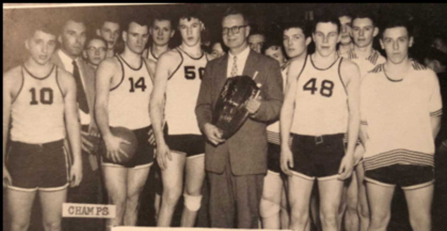
KHS 1959 Basketball Team