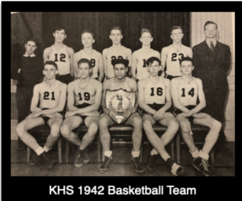
KHS 1942 Basketball Team