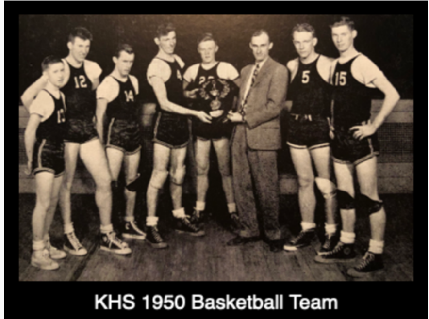
KHS 1950 Basketball Team

1950 Kennett's second state championship in basketball was given only an outside chance of winning the coveted title in 1950. However, the team fooled the experts and the team endeared themselves to basketball fans all over the state "for their fighting spirit and excellent team play." Given the nickname of the "Black Knights" by the state sportswriters, the team was forced to come from behind time and again, and they refused to give up.