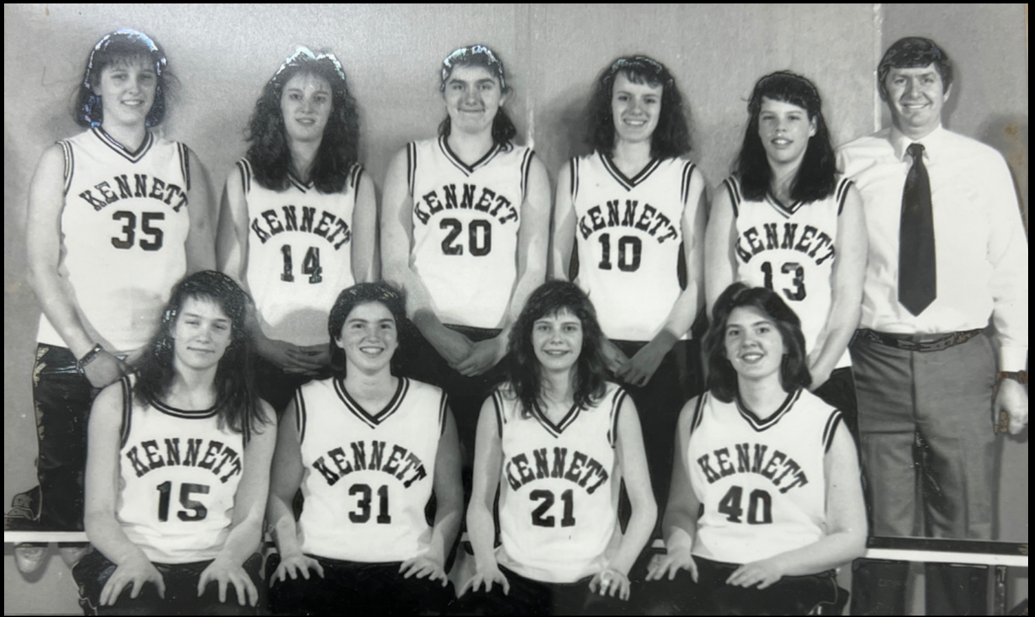
KHS 1989 Basketball Team