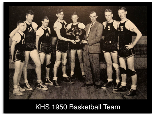
KHS 1950 Basketball Team

Given the nickname of the "Black Knights" by the state sportswriter, the team was forced to come from behind time and again, and they refused to give up.