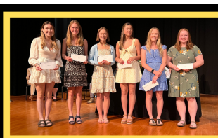
Ellis W. McKeen Scholarship