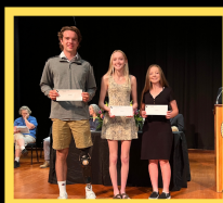
George T Davidson Scholarship