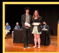
Virginia Small Scholarship