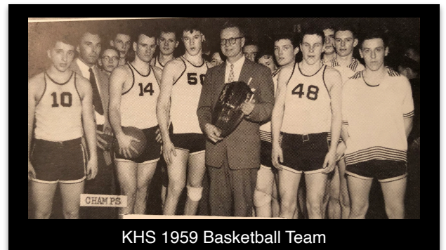
KHS 1959 Basketball Team