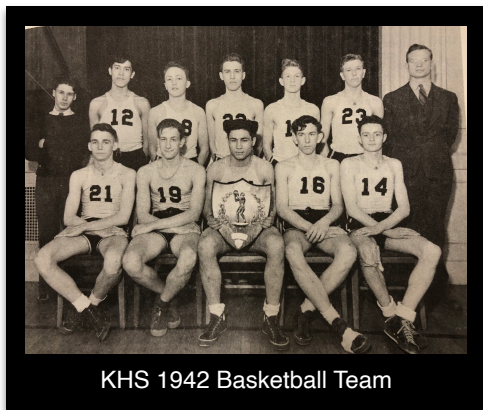
KHS 1942 Basketball Team

Playing Class "B" competition at the time, similar to Class "M" later, the Eagles won 6 games and lost none. The Eagles lost to a strong Class "A" team from New London High School, Connecticut and twice in one point defeats at the hands of the Berlin High Mountaineers, at that time a Class "A" power.