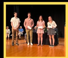
Karl Seindenstuecker Scholarship