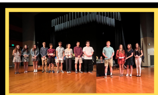
Kennett Alumni Scholarship